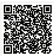
Guidelines for On Board Sampling